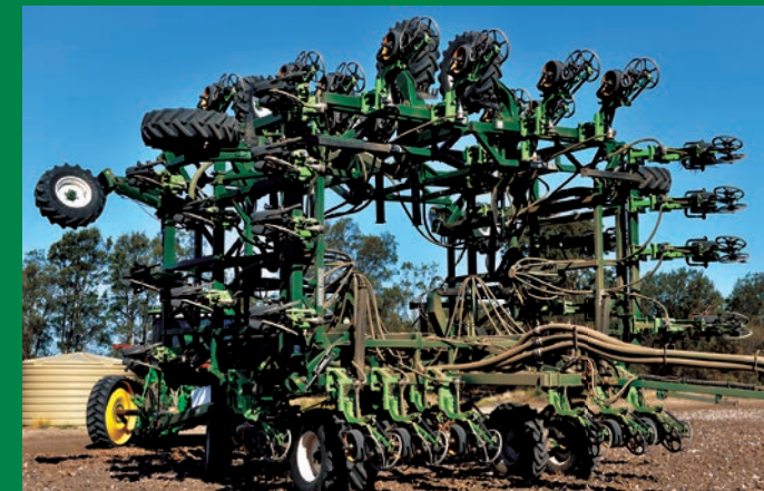
18 metre double fold forward with SP200 fitted