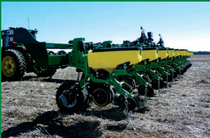
18 metre fold forward with SP200 option with precision boxes