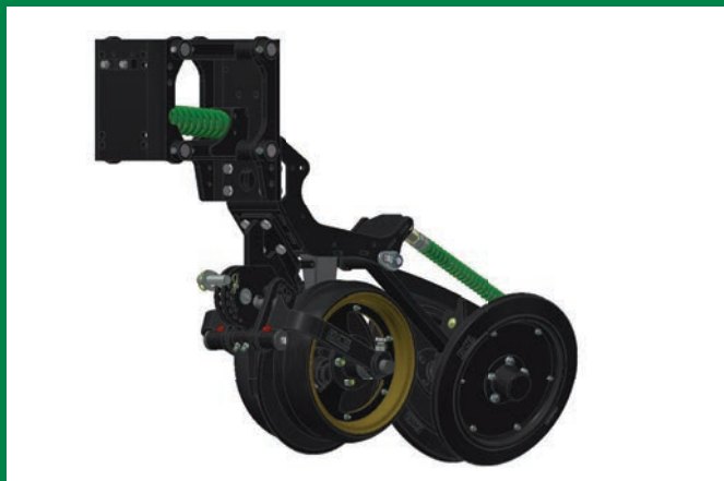
Standard SP200 Row Unit