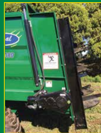
Steel discharge door controlled by hydraulic lift.

High build epoxy protective coating with good chemical and corrosive resistance on interior of bins.