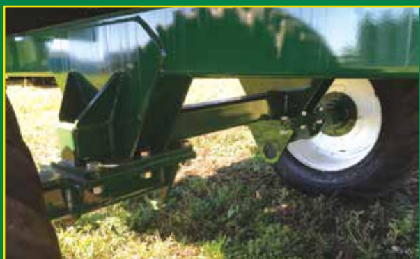
Robust axle assembly.