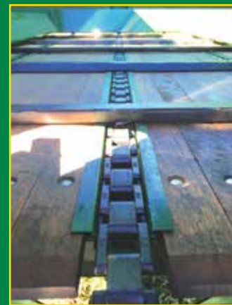
High tensile floor chains on hardwood floors.