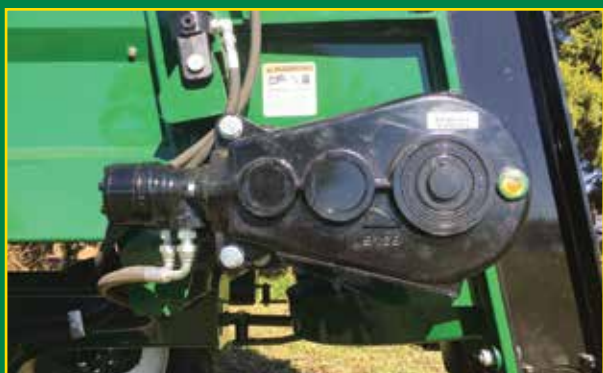
Hydraulic driven heavy duty reduction box for floor chain drive.