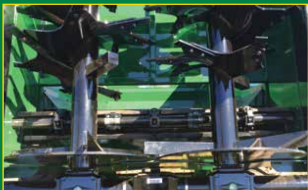
Positive chain floor delivery system onto the beaters.